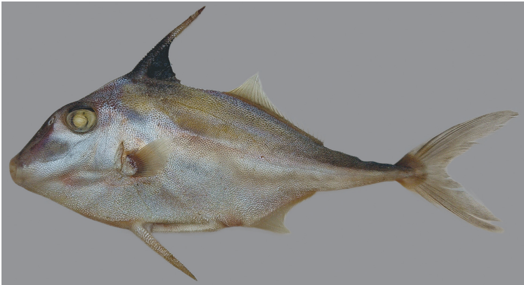
Figure 2. Triacanthus biaculeatus (Bloch, 1786) [BD/KAUST-0823-004]; 180 mm TL; Jizan, southern Red Sea, Saudi Arabia.