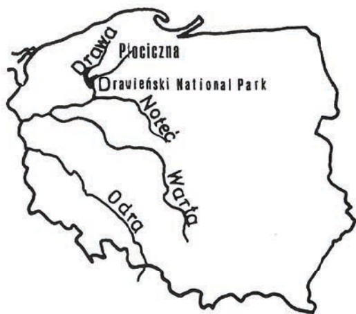
Fig. 1. Location of the Drawieński National Park in the Odra River system