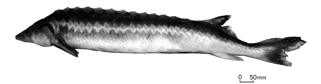
Fig. 2. Russian sturgeon caught in the Baltic Sea on 20 October 2001

The morphometric analyses of the specimens were performed using methodology of Krylova and Sokolov (1981). The results obtained, suggested that these were Russian sturgeons, Acipenser gueldenstaedtii Brandt et Ratzeburg, 1833 (Table 1). The range of this species covers the Black-, Azov-, and Caspian Seas and their drainage areas (Vlasenko et. al. 1989), which is quite distant from the present capture sites (Fig. 3). Also meristic features of the specimen caught fit into the range specified in the descriptions of the above-mentioned species (Vlasenko et al. 1989). Additionally, a discriminatory analysis (Stepwise Discriminant Analysis, Statistica 5.0) carried out on the data sets describing mensural features of 93 specimens Russian sturgeons, 27 Siberian sturgeons, and 20 specimens of an interspecific hybrid (of the same total length class), cultured in warm-water cages (40.0–49.9 cm and 50.0–59.9 cm) revealed in the classification matrix, that the specimens studied represented the data set specific for the Russian sturgeon. According to the analyses performed (DF = 1.107, p = 3.34E-05), the most important feature in discriminating the two species and the hybrid was the distance between the tip of the rostrum and the cartilaginous arch of the mouth opening (s-mc) (the abbreviations used follow those of Holčik 1989).