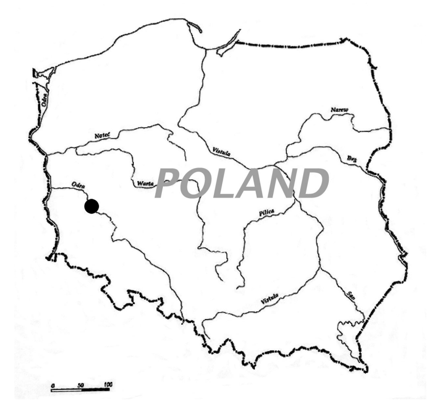
Fig. 1. The location of the sampling site of zope, Abramis ballerus, in the middle stretch of the Odra River