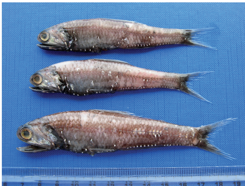
Fig. 2. Specimens of Notoscopelus elongatus (PRM-PIS 2009-0063) caught in the northeastern Aegean Sea, Turkey

The most interesting morphological feature of our material is the presence in the smaller specimen (TL 103 mm)