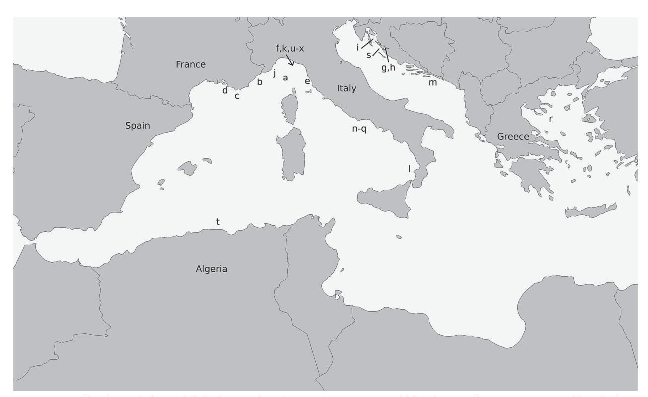
Fig. 1. Localisation of the published records of Lampris guttatus within the Mediterranean sea; Abbreviations explained in Table 1

captured near Les Embiez Island in 1997 (the same record is also reported in Quignard and Tomasini 2000). In this paper, we report recent occurrences of L. guttatus in the western Mediterranean, mainly along the French Mediterranean coast, and review all the available knowledge about its distribution and abundance.