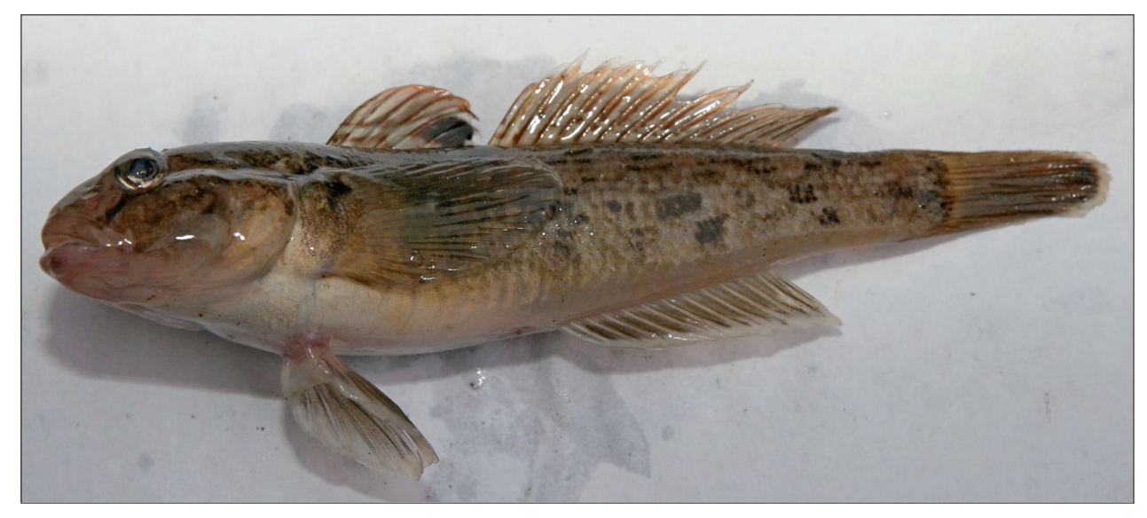
Fig. 2. First recorded specimen of Neogobius melanostomus in Belgium (10.5 cm TL)