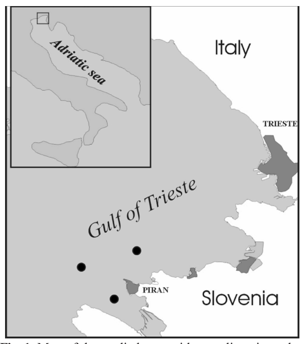
Fig. 1. Map of the studied area with sampling sites where Mustelus punctulatus , were caught from June 2002 to June 2003