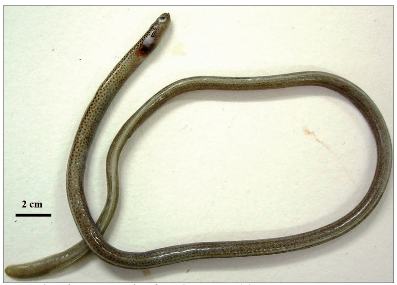
Fig. 2. Specimen of Heteroconger tomberua from Indian coast; general view