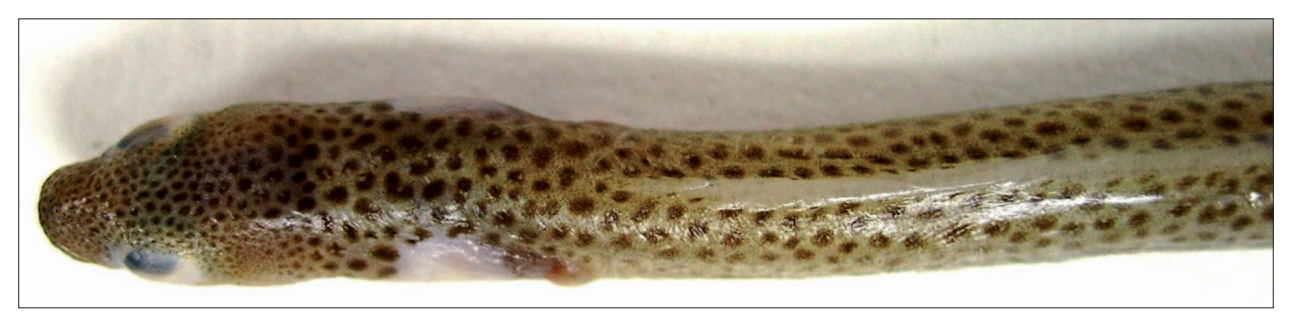
Fig. 3. Specimen of Heteroconger tomberua from Indian coast; dorsal view of anterior part

Remarks. From the body markings and size of the eel it was first assumed to be Gorgasia klausewitzi. However, the presence of a short mouth with its angle reaching just below anterior rim of eye (Fig. 4), a band of teeth in jaws and vomer and confluent upper lip lead us to consider it to be a Heteroconger species. The majority of the known Heteroconger species of Indo-Pacific region have from 144 to 176 total vertebrae. Only four known species of Heteroconger in the world, i.e., H. cobra Böhlke et Randall, 1981; H. mercyae, H. tomberua, and H. tricia do have more than 180 vertebrae. Three prominent dark and light u-shaped saddles in H. cobra and zebra-like black and white bars on head of H. mercyae distinguishes clearly from the present specimen. H. tricia closely resemble H. tomberua but differs in having about 210 vertebrae and relatively large, evenly spaced, round dark spots. Hence, our specimen was identified as H. tomberua, which was