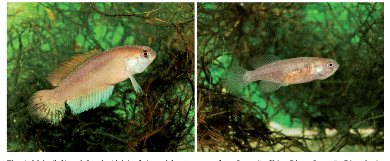
Fig. 1. Male (left) and female (right) of Austrolebias quirogai from Jaguarão-Chico River, Jaguarão River basin, southern Brazil; Photo by Matheus Volcan

In recent years, various species of Austrolebias have been recorded in southern Brazil. Only in the last ten years,