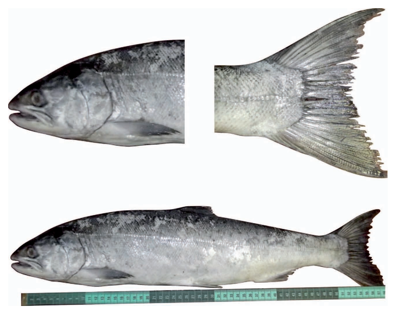
Fig. 2. Female of coho salmon, Oncorhynchus kisutch (ENIP-CI-387), 520 mm SL, collected at Las Barrancas, Baja California Sur, Mexico, on 30 July 2013

The presence of Oncorhynchus kisutch in waters close to Las Barrancas could be the result of a combination