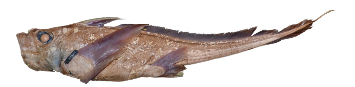
Fig. 2. Chimaera opalescens from NW African slope (MMF37260, 858 mm TL, male, 26.05°N, 15.27°W; 897 m)

Before this study, only two species of the family Chimaeridae were known to occur in Madeira, Chimaera monstrosa (see Maul 1949) and Hydrolagus affinis (de Brito Capello, 1868) (see Freitas et al. 2011). While reexamining the MMF specimens, originally identified as C. monstrosa , we came to the conclusion that they were in fact Chimaera opalescens . Since we were not able to locate specimens of C. monstrosa from Madeira in museum collections and Maul's (1948) reference is older than the oldest specimen in MMF, the occurrence of C. monstrosa in Madeira remains dubious.