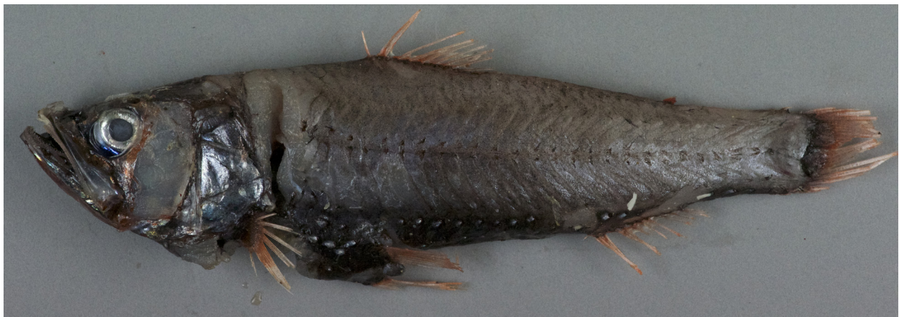
Fig. 2. Specimen of Neoscopelus macrolepidotus from the Porcupine Bank (IEO-ST-PC16/056)

The MOW contribution to the northward distribution of species from lower latitudes has already been suggested before by De Mol et al. (2002, 2005) who hypothesized that the large deep-water coral banks of Lophelia and Madrepora in the Porcupine basin could have been originated by the introduction of larvae transported by the MOW from the Mediterranean to the northeast Atlantic. The same pathway of dissemination has also been suggested for the Polynoidae polychaetes, Harmothoe