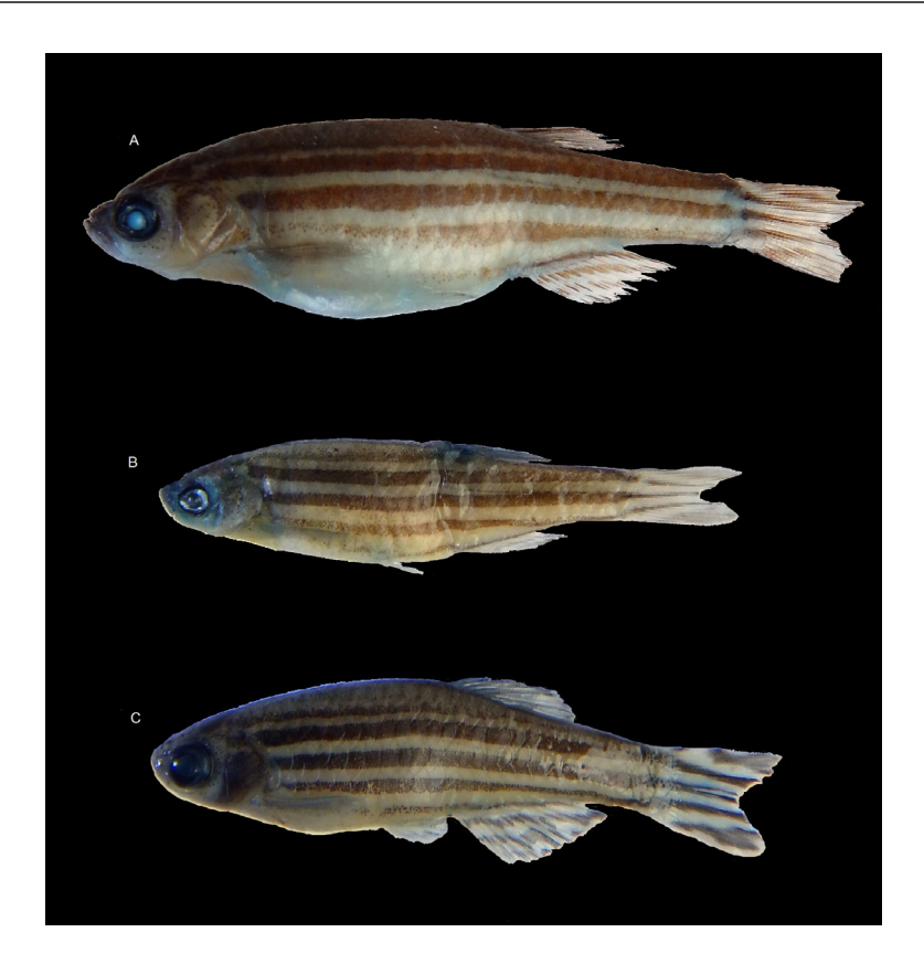
Fig. 2. Danio rerio CIARI/FF-01, 33.78 mm SL, gravid female, Rangat, Middle Andaman (preserved) (A); NBFGR-CH-1180, 22.4 mm SL, Kalpong River, Diglipur, North Andaman (preserved) (B); NBFGR-CH-1179, 24.7 mm SL, Alipurduar, Kolkata (freshly preserved) (C); photo credit: J. Praveenraj