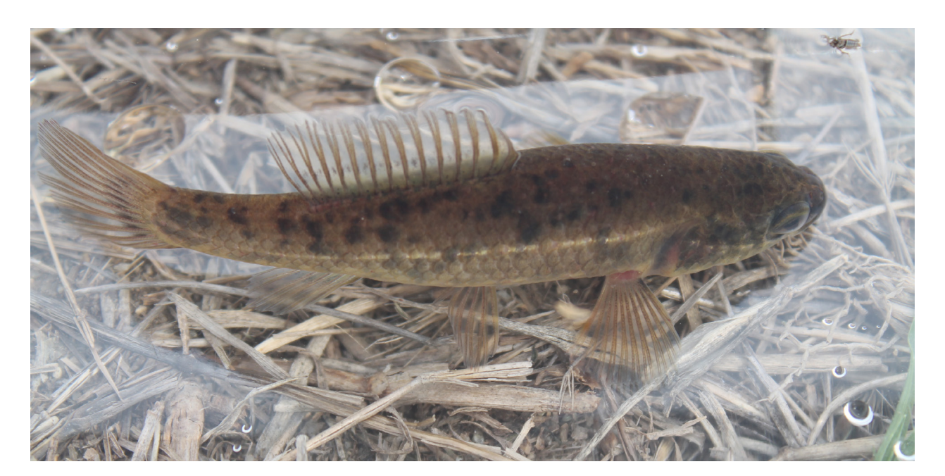
Fig. 2. Umbra krameri individual from the new distribution locality in south-western Romania