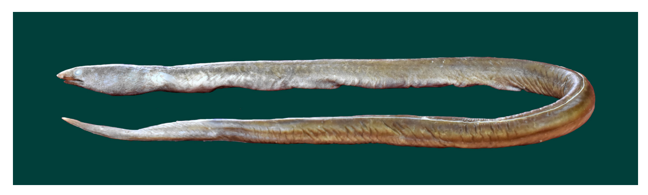
Fig. 1. Ophichthus machidai from Bay of Bengal, India (Reg. No. EBRC/ZSI/F 10205; TL – 457 mm)

Ophichthus machidai was described on the basis of 23 specimens from Japan (McCosker et al. 2012) and later, it was reported from Taiwan (Chiu et al. 2013) on the basis