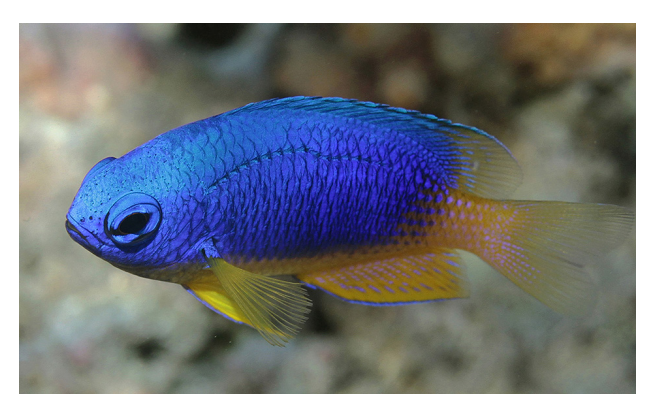
Fig. 2. Pomacentrus caeruleus ; individual photographed at Reunion, ca. 3 cm SL

Fig. 1. Individuals of Pomacentrus caeruleopunctatus from Madagascar and Reunion Island (field photographs); (A) Individual photographed off Nosy Fanihy Island (Madagascar), about 45 km from the Mitsio Archipelago, the type locality; (B) First individual recorded from Reunion, 18 January 2012, ca. 4.9 cm SL; (C) Second individual observed at Reunion, 1 March 2012, ca. 7.5 cm SL