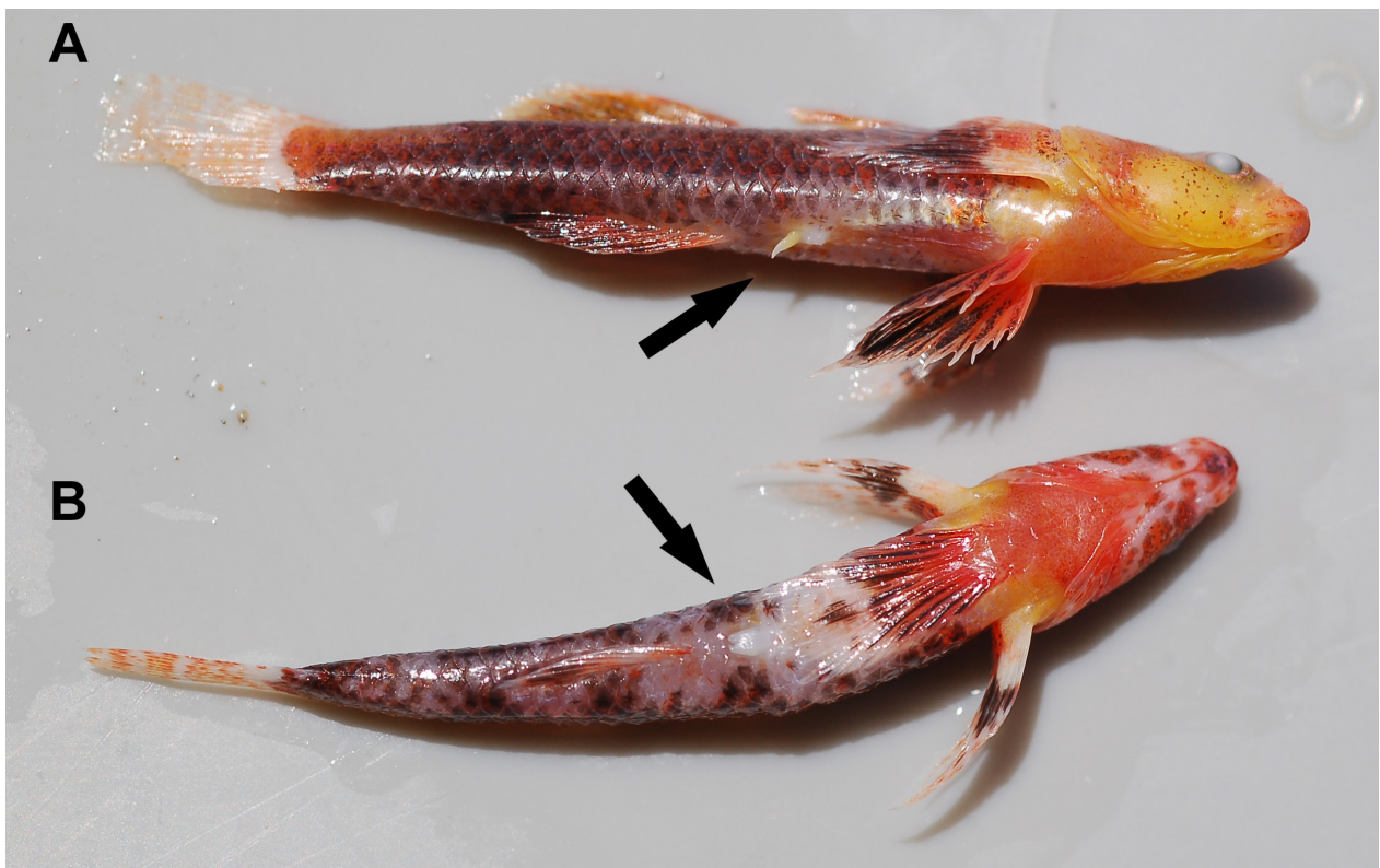
Fig. 2. Speleogobius llorisi freshly preserved with visible urogenital papillae: (A) male, 26.7 + 5.6 mm, PMR VP4357, (B) female, 25.8 + 5.6 mm, PMR VP4356, both Tatinja, Hvar, Croatia, Adriatic Sea (43°13.017'N, 16°38.265'E), 13 June 2018