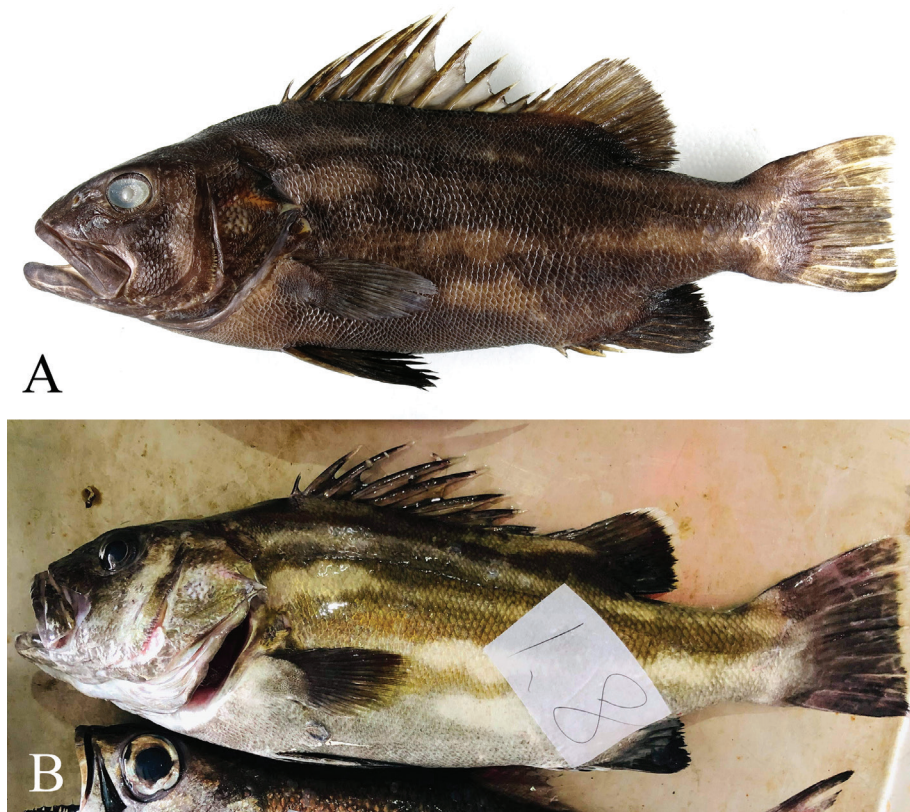
Figure 1. Stereolepis doederleini , NMMB-P32813, 385 mm SL, off southeastern Taiwan. (A) preserved condition. (B) fresh condition at auction.

Head length 2.7 times in SL (36.9% SL); body depth at pectoral-fin base depth 2.9 (34.2); body width at pectoral-fin base 5.2 (19.2); predorsal length 2.7 (36.4); prepectoral length 2.8 (36.4); prepelvic length 2.7 (37.1); distance between origins of pelvic and anal fins 2.8 (36.4); dorsal-fin base length 2.1 (48.1); anal-fin base 7.0 (14.2); caudal-peduncle length 5.2 (19.2); caudal-peduncle depth